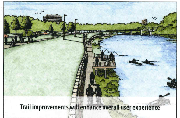
Trail improvements will enhance overall user experience

Work on the Waggoner Trailhead and associated improvements are expected to continue until the end of the year. An alternate route will be suggested for trail users who need to cross University Dr. until construction in the area has been completed.